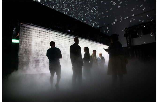
Image Credit: Atmospheric Memory by Rafael Lozano-Hemmer, Cloud Display 11, (2019), MIF19, copyright Mariana Yáñez

Step 4: Next, choose a watercolor color to match the emotion of each word. Maybe it’s more than one color? Paint over your words and watch as the words are magically revealed.